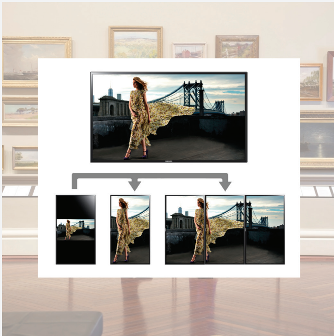
Figure 3. Portrait to landscape image rotation enhances usability with no loss of resolution

UED Series displays offer pivoting capability and image rotation software that can change image orientation from portrait to landscape for greater display flexibility. For convenience when rotating images, two ratio options are available: original ratio or auto full-sizing ratio. Users do not need to rotate a picture in the software to make it appear correctly in a different orientation.