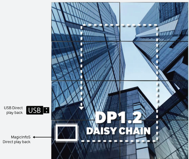
Figure 4. The HDCP daisy chain function reduces the cost of deploying multiple displays to manage each display in a video wall

By using the DP 1.2 port, businesses can display content resolutions of 3,840 x 2,160 in 2 x 2 video walls. The port enables such high resolution content to maintain its quality without the need for additional equipment. With no complex distributors' equipment to connect, a digital daisy chain allows simpler configuration with less clutter.