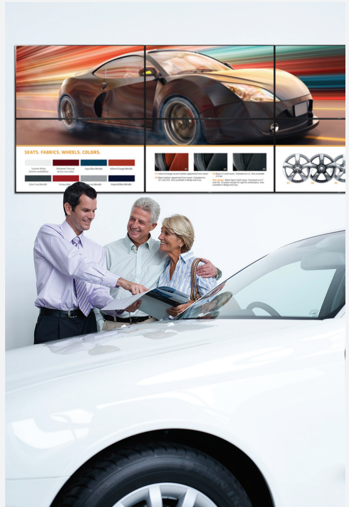
Figure 2. Improved video wall color calibration for color uniformity

The integrated factory color tuning process has been refined for white balancing and color difference compensation, resulting in improved color temperature matching. The Samsung Color Expert software with built-in ACM chipset is also enhanced for ease of use and performance and offers three options: gamma calibration, local uniformity and white balance. The calibration speed is higher and the user interface (UI) is augmented for more precise color management. Light reflection, absorption and scatter are significantly reduced with the help of the Ultra Clear Panel. As a result of Ultra Clear Panel technology, images are brighter and sharper, which ultimately improves content visibility.